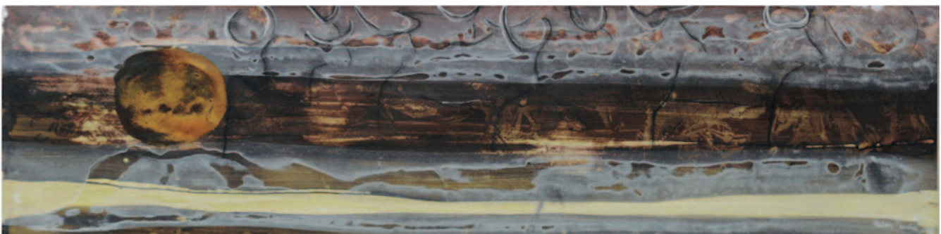
"The Hike" 64,5 X 20,5 cm, acrylic, pastel on paper, 2009

The artist Petra Sophia Ott lives in a village in Bavaria / Germany. Here she has her studio in a lovingly renovated farm. Petra Sophia Ott's life is full of creativity. Art is her passion. The artist appears with all her senses into the magical world of colors. Natural materials are woven into the painting. In the dance with the colors it produces pictures and stories with deep and closeness of nature.