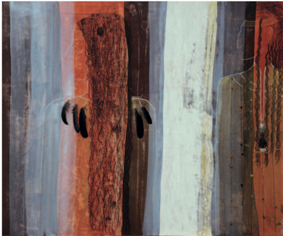
"DreamHiker" 120 X 100 cm, acrylic, pastel on canvas, natur applications, 2013

The artist Petra Sophia Ott lives in a village in Bavaria / Germany. Here she has her studio in a lovingly renovated farm. Petra Sophia Ott's life is full of creativity. Art is her passion. The artist appears with all her senses into the magical world of colors. Natural materials are woven into the painting. In the dance with the colors it produces pictures and stories with deep and closeness of nature.